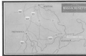
The Campus is a four hour drive from New York City and one hour from Boston and Providence

Follow MMA signs on rotary to Main Street. Once on Main Street in Buzzards Bay take a left at the only set of lights onto Academy Drive.