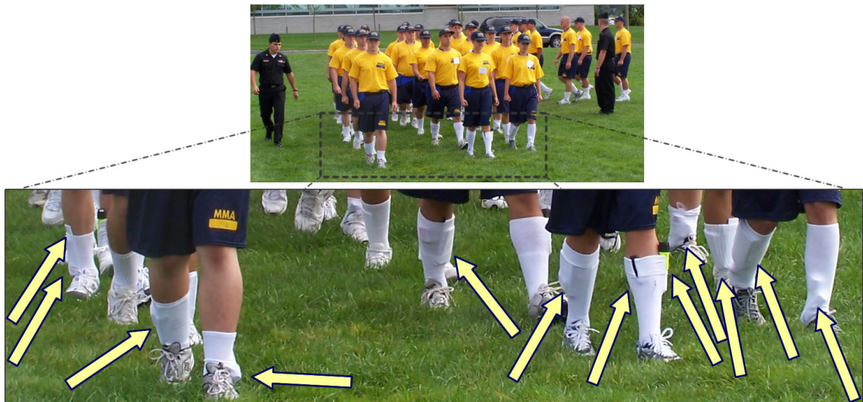
Examples of items carried in socks: Youngie Knowledge booklet, flashlight, pocketknife, lighter (for ropework), notepad, pen, etc.

In a word: "high." The socks are not a fashion statement -- they actually serve an essential carrying function. A picture is worth a thousand words (so here's 2,000 words worth – plus a few words!):