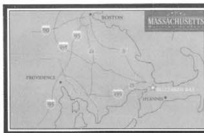
The Campus is a four hour drive from New York City and one hour from Boston and Providence

Follow MMA signs on rotary to Main Street. Once on Main Street in Buzzards Bay take a left at the only set of lights onto Academy Drive.